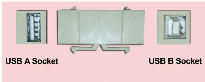
USB A Socket